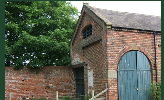
The Blacksmith s Yard

The cluster of buildings that form the Blacksmith s yard represent a similar style of architecture, but arranged in a smaller grouping.