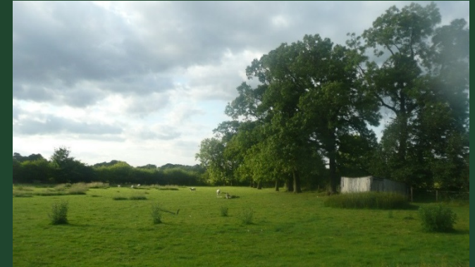
One of the fields included with the sale

Included with the farm is the former walled garden of the hall, as well as a number of fields that will be suitable for use as gardens, pony paddocks or open space for the dwellings.