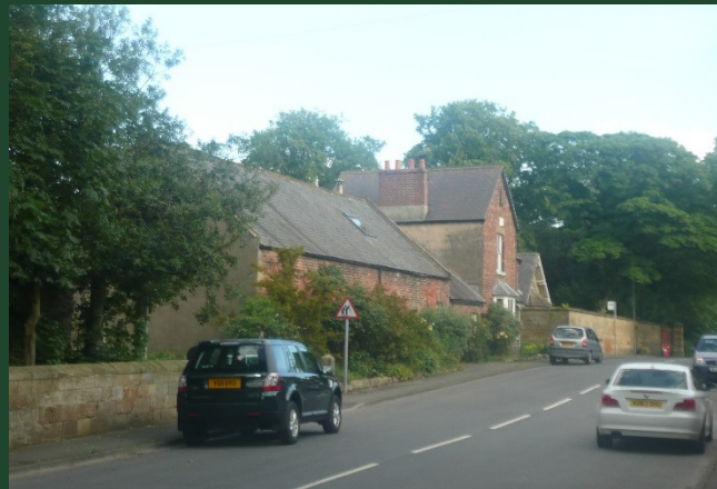
The house and one of the farm buildings as seen from the road

The farm buildings primarily comprise a farmhouse and a range of predominantly single storey buildings (with some two storey elements), constructed in brick under pitched, slate covered roofs. The buildings are coming to the end of their life for agricultural purposes (due to issues such as low eaves heights), but are ideal for conversion to residential use, as they will create a barn conversion type development arranged around a central courtyard.