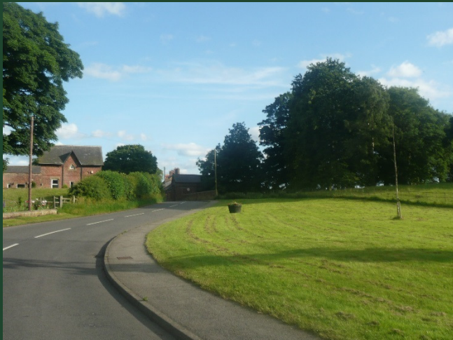
The approach to the village

The development will be situated in a highly sought after location in a rural setting within the village of Nunthorpe. This is a small and traditional village, designated as a conservation area. It is centred on the Hall and has buildings located on either side (Westside and Eastside) of a quiet road (the village is bypassed by the A172). Despite the quiet rural setting, the sites are situated immediately to the south of the town of Middlesbrough, and have excellent road links in all directions. All these factors make this an ideal location for a high quality bespoke development that will be much sought after.