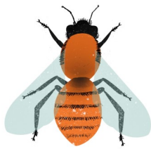
Tawny mining bee* (Males are smaller and browner)