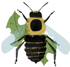
Willughby's leafcutter bee cuts perfect circles in leaves