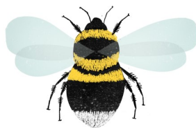
Garden bumblebee Has a long tongue