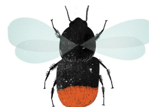
Red tailed bumblebee* (Males have yellow facial hair)

Spend an hour in your garden or local green space and tell us what you find! We'll use this information to build a picture of what we have in our town.