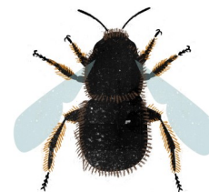
Hairy footed flower bee (Males are lighter in colour)