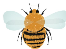
Common carder bumblebee (Male has facial hair)