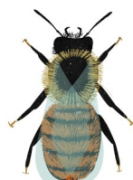
Red mason bee* Makes holes in mortar